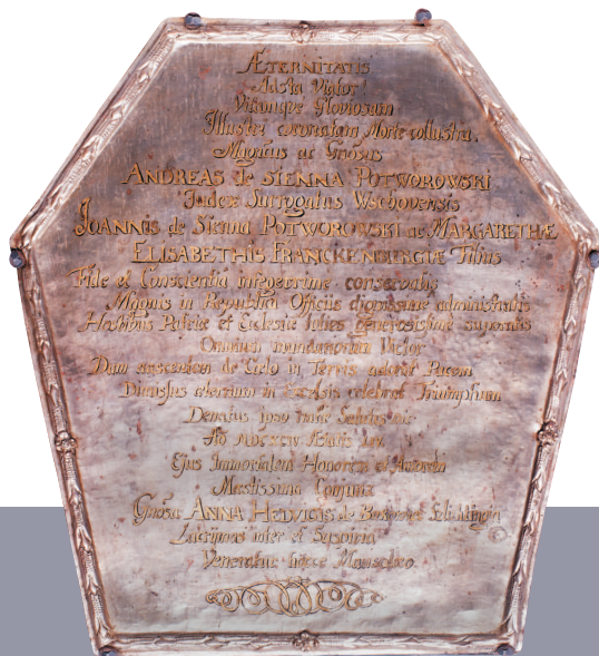
Inscription plaque of Andrzej Potworowski of Sienno Dębno coat of arms accession no: MZW/AH/24

The exhibition "Soli Deo Gloria. Protestant Cultural Heritage in the Wschowa region in the 16 th -18 th century." was modernized in 2014 owing to the support of the Ministry of Culture and National Heritage within the "Cultural Heritage – Support of museum activities" programme.